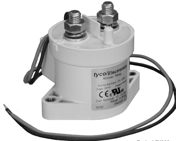
EV200 Series Contactor (CZONKA® Relay, Type III)

Typical EV200 applications include battery switching and back-up, DC voltage power control, circuit protection and safety.